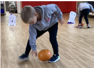
Year 1 Halloween pumpkin rolling and ghost bowling